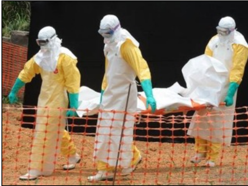
Image 1: Trained personnel wearing protective equipment in the removal of an Ebola patient (Cooper, 2014).

Human-to-human transmission of the virus still occurs even when the infected person is deceased. Approximately 20% of new Ebola infections occur during burials of deceased Ebola infected individuals (WHO, 2014). Establishing a safe burial practice involves no direct contact with the corpse and the burial being carried out by trained personnel wearing protective equipment (Matua et al. , 2014). WHO have created a 'Safe and Dignified Burial Protocol' in order to comply with the religious beliefs and cultural traditions as well as ensuring that the transmission of the virus is minimised.