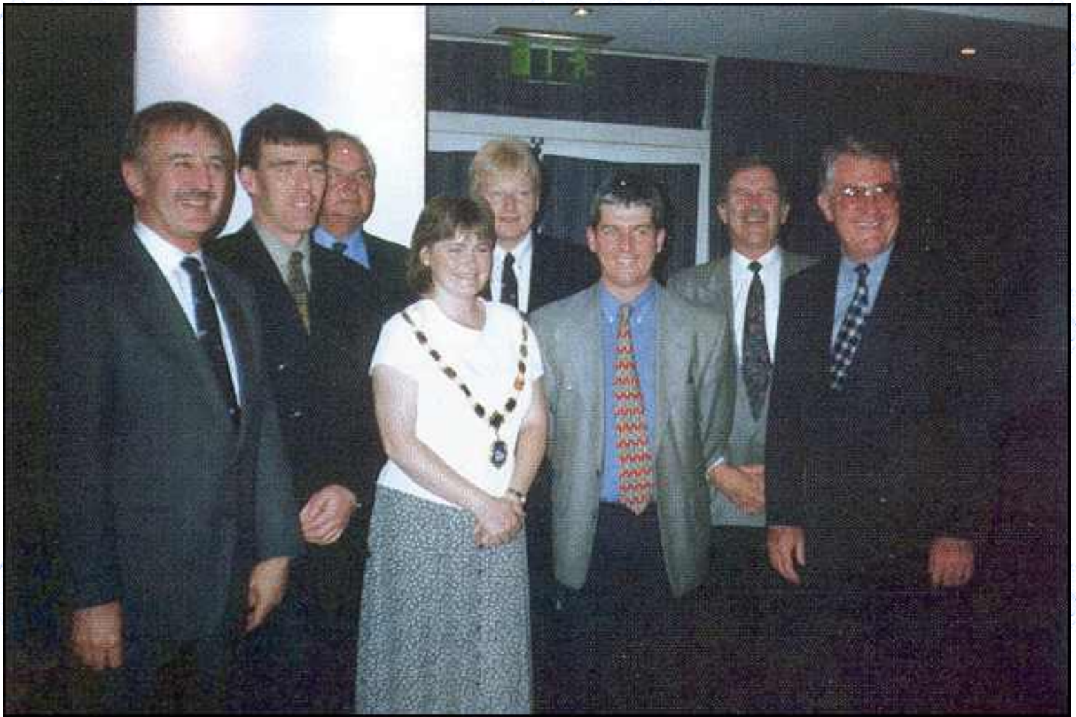
Signing party for declaration of Westport