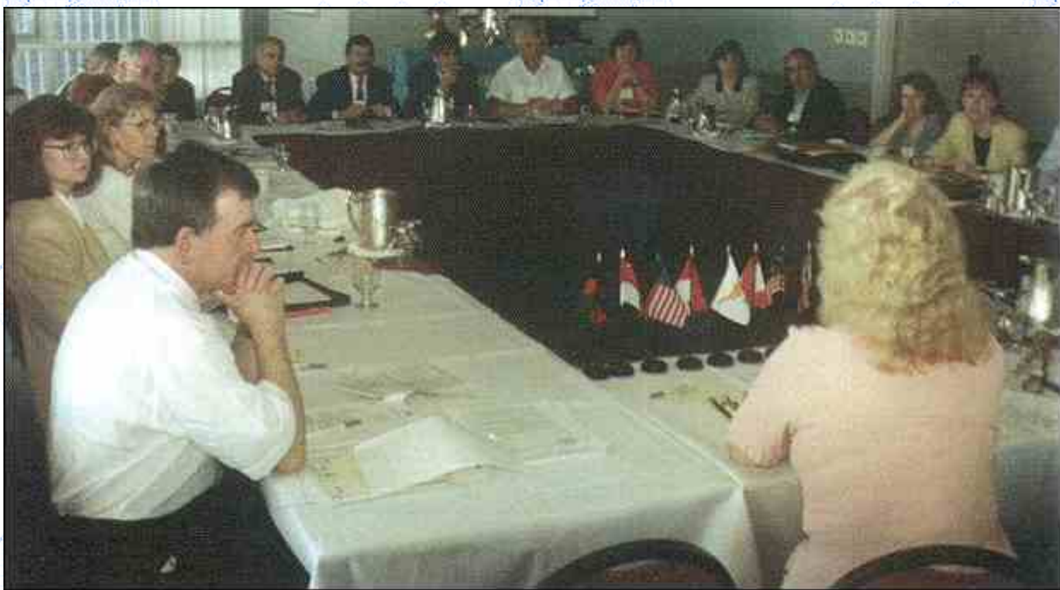
Council meeting Los Angeles