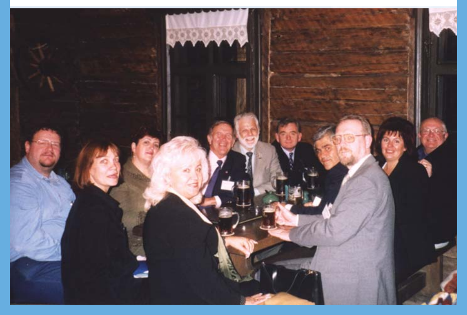
Bottom: Europe Group hard at work!