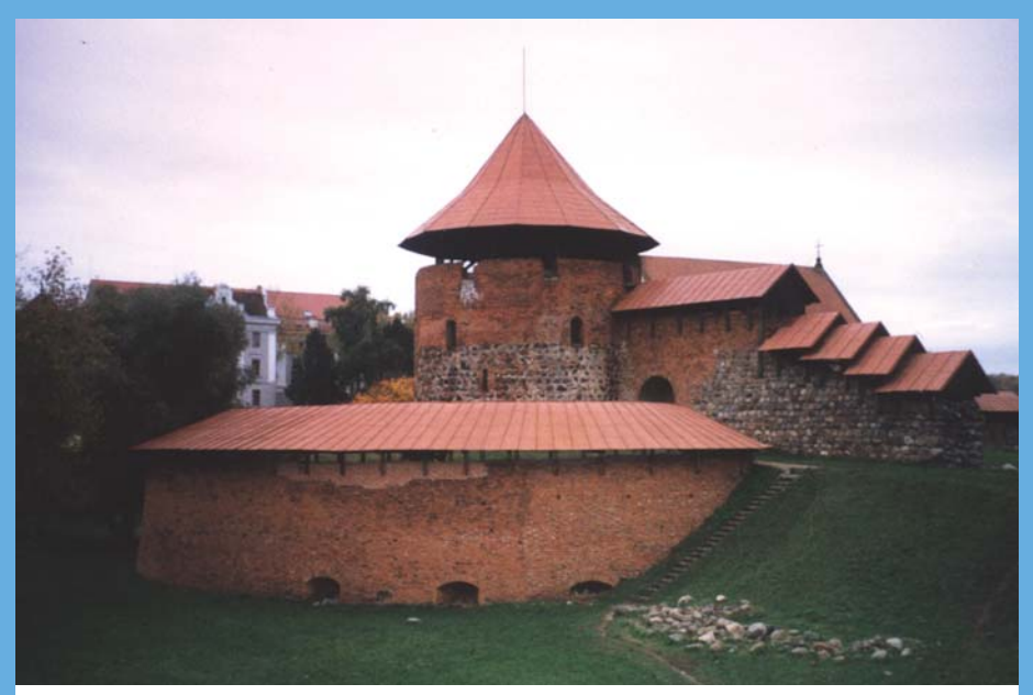
Top: Vilnius, Lithuania - venue for meeting of Europe Group