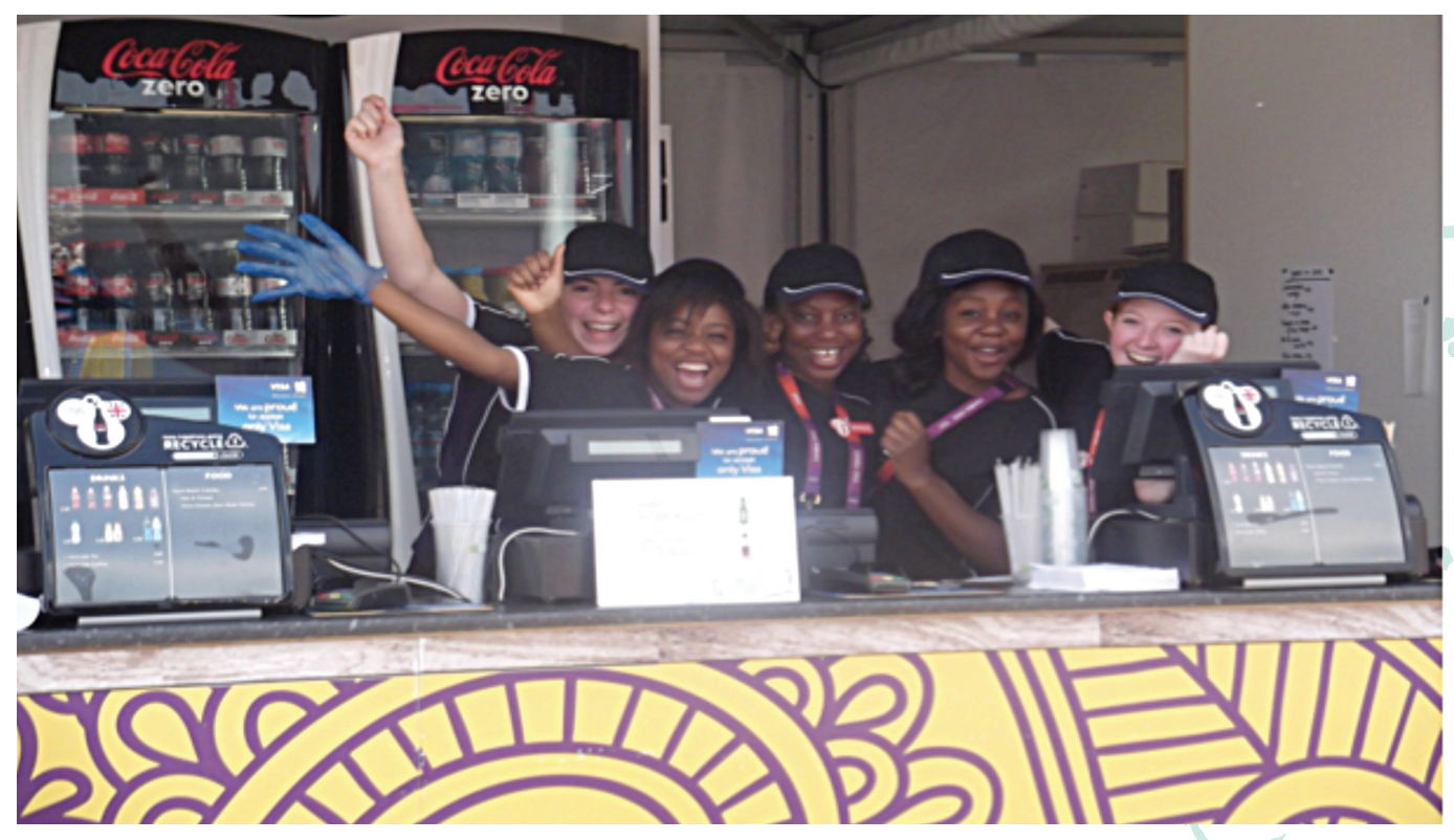
/ Last day at the Indian snacks and Deli at the Hockey stadium!