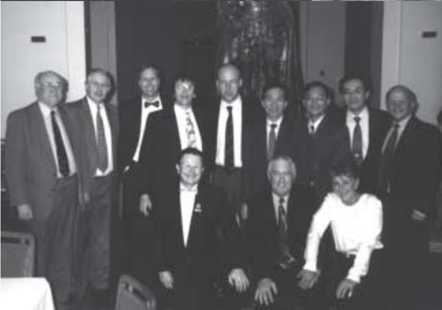
Top: Brighton, England, 1991