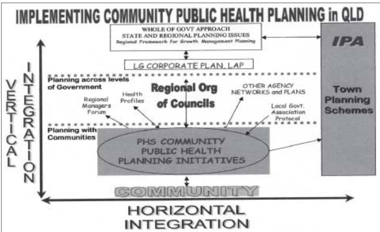
Figure 2: Integrating Community Public Health Planning in Queensland A ‘Platform Approach’

A ‘Platform Approach’ has been developed from the study and is currently being tested in local government (Kingaroy Shire and Gold Coast City).