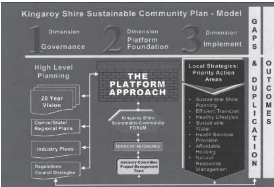
Figure 3: Example of a Sustainable Community Plan Kingaroy Shire – 2005

for communities engaged in the process in Queensland. In the communities evaluated, project participants reported that the aims of the MPHP project were realised, with participants having improved networking opportunities, improved working partnerships - both within departments and across agencies - and more program accountability. There was an increase in community participation in the health agenda and politicians were more focused on delivering health aims. Agencies participating in the MPHP process had gained a clearer understanding of the roles of each agency in health promotion and this was favourable for health outcomes.