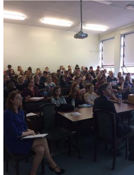
Over 70 Students Attended WEHD in DIT