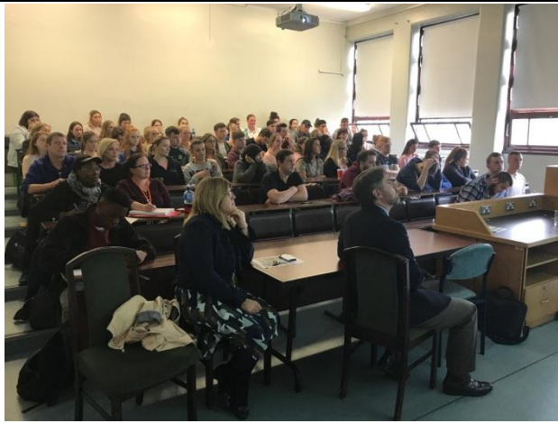
WEHD Seminar DIT

in the School of Food Science & Environmental Health, September 26 th 2016