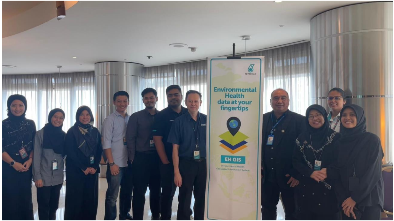
Figure 3: Launch of PETRONAS' Environmental Health Geographic Information System (EH GIS)