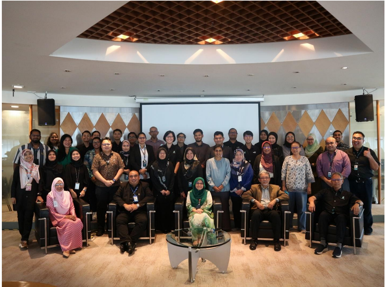
Figure 2: Environmental Health Technical Session Panelist and Attendees