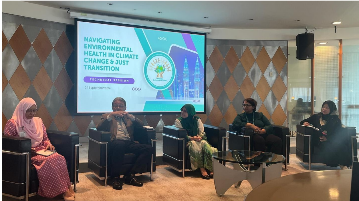
Figure 1: Panel Discussion on Navigating Environmental Health in Climate Change & Just Transition