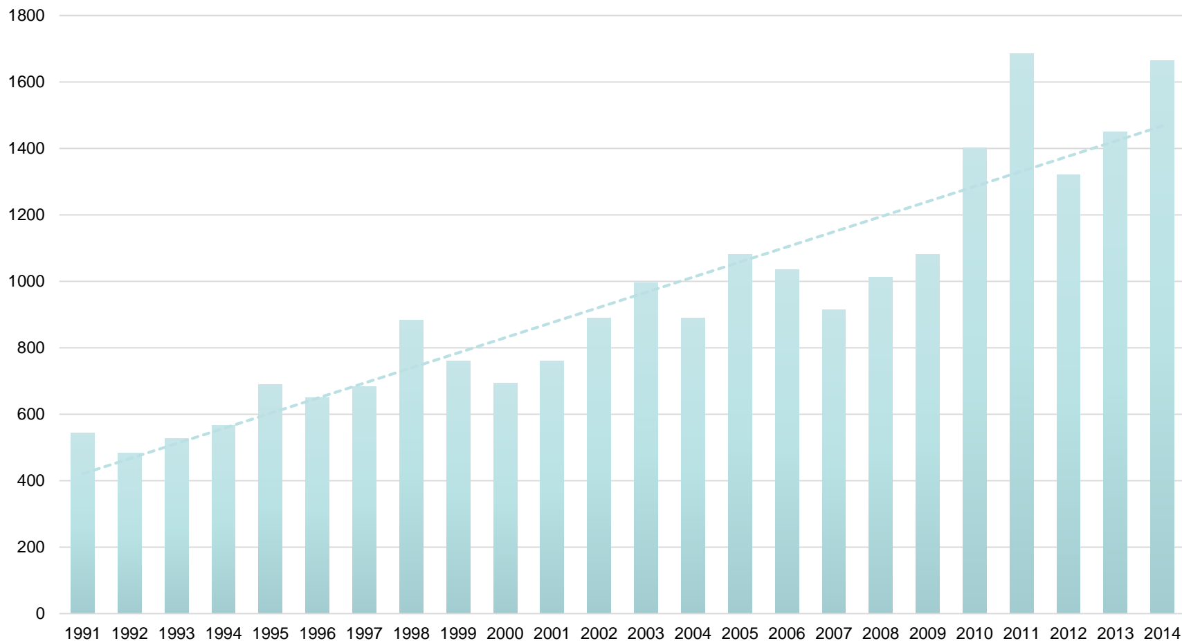
Number of notifications of Campylobacteriosis*, Australia, in the period of 1991 to 2014 and year-to-date notifications for 2015