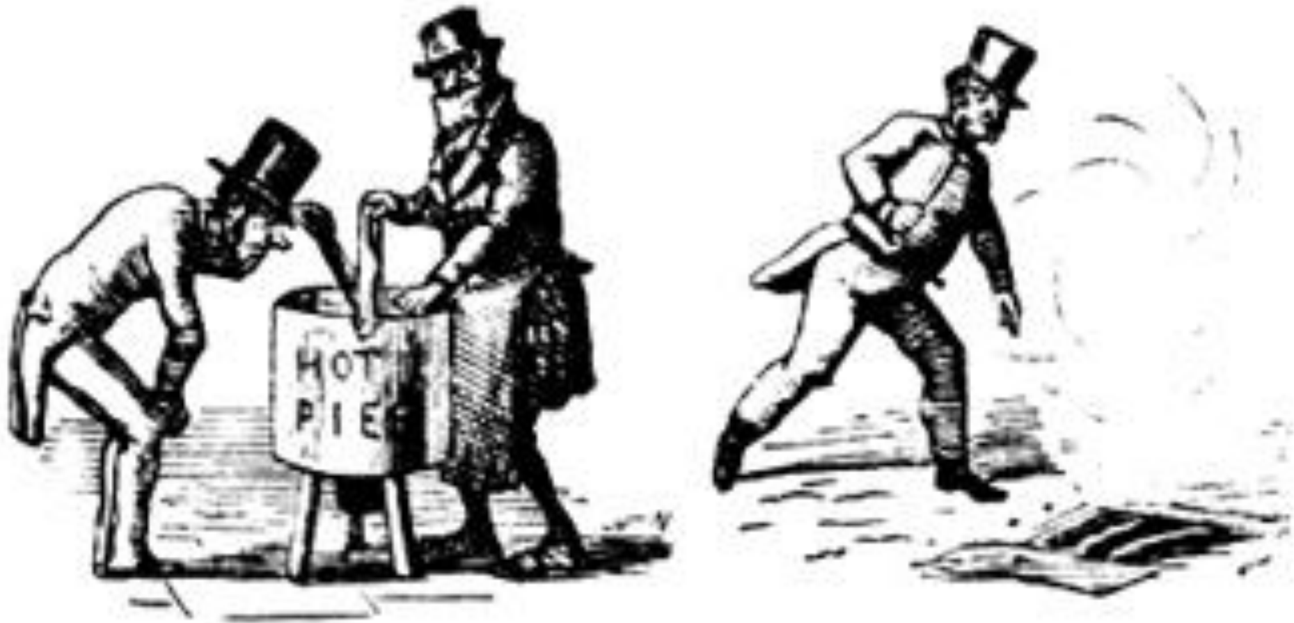
The Sanitary Police, as seen by Punch